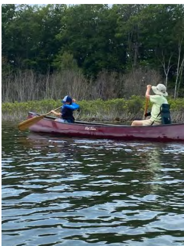
For our great grandchildren.

Contribute online at saveMIwater.org or mail a check to MCWC, PO Box 1, Mecosta, MI 49332