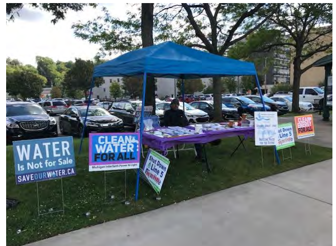
Tabling in Grand Rapids.