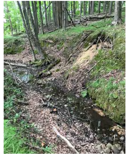
Headwaters on Twin Creek.