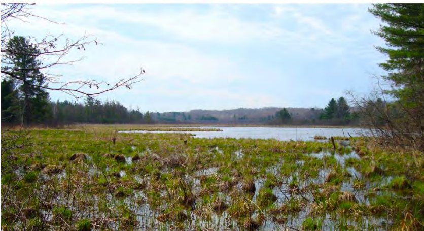
Bull Kill Marsh near proposed Potash Mine site.

It is not entirely Michigan Potash's fault that they have neglected to do so much of what should be required of a company attempting to start a billion-dollar solution- mine. Michigan's DEQ (now EGLE) has fallen far short on its duty to vigorously enforce provisions of Michigan's Environmental Protection Act (MEPA) which were intended to minimize damage to the environment. Instead of requiring a full Environmental Impact Assessment (EIA) to study, test, evaluate, and compensate for the limitations of a deeply flawed site, EGLE merely required a 4-page, fill-in-