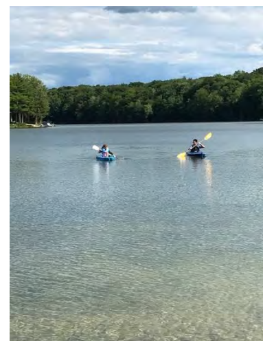
For our children and grandchildren.