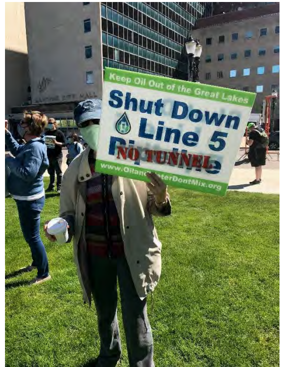
MCWC in Lansing.