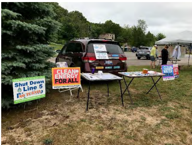
Tabling during pandemic at Elberta Farmer’s Market.

We will also continue our role in education and advocacy around the related water issues facing the Great Lakes Basin: equal access and affordability of clean drinking water and sanitation; ending pollution from PFAS, injection wells, fracking, and agricultural run-off; shutting down oil & gas pipelines such as Line 5 and the dangers they impose; exposing solution mining operations threatening our groundwater and wetlands; educating around the global water grabs of private corporations that threaten the human right to water and ecosystem requirements worldwide.