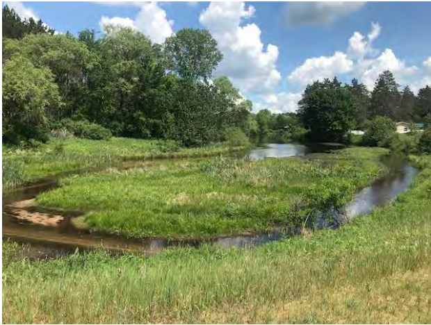
Mudflats on Chippewa Creek.