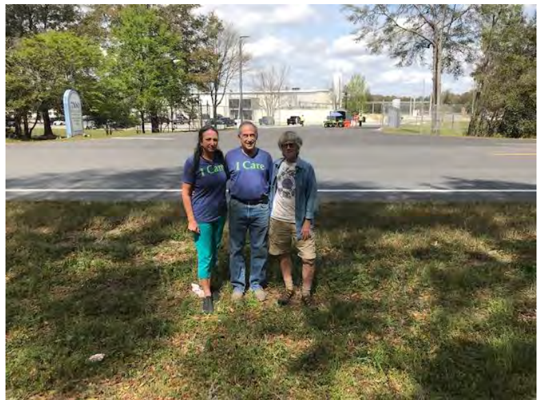
MCWC with Our Santa Fe River in Florida.