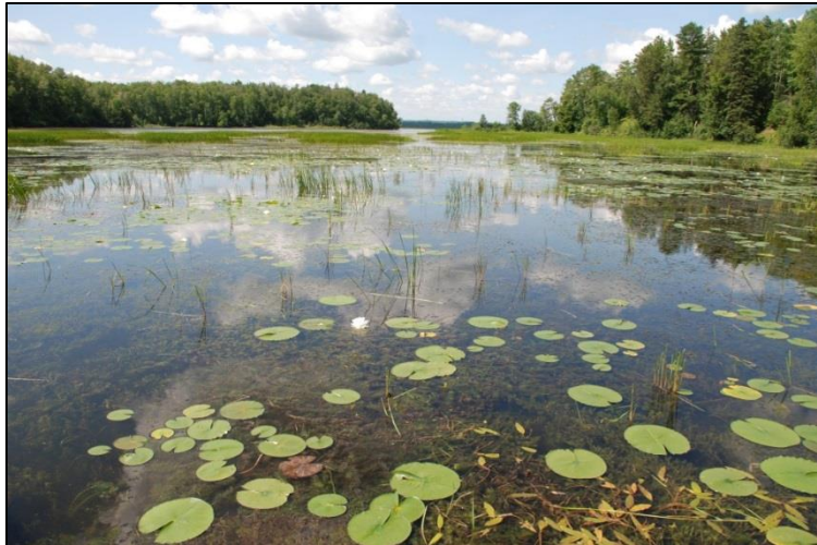
Figure 5. Pokegama Bay, Lake Superior.

Generally, water use in North America has levelled off and the Great Lakes Basin has made gains in water use efficiency since the signing of the Agreement. However, the region holds significant untapped potential to improve water efficiency performance in the areas of infrastructure maintenance.