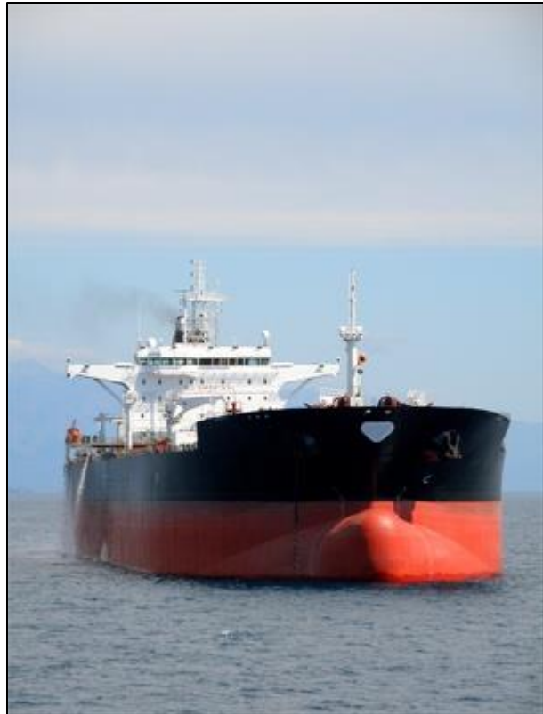
Figure 2. Great Lakes Tanker.

In its 2000 report, the IJC recommended that the governments of the Great Lakes states and provinces should not permit any proposal for removal of water from the Great Lakes to proceed unless the proponent could demonstrate that the removal would not endanger the integrity of the ecosystem of the Great Lakes and that certain other conditions be met. The most critical of these conditions was that there be no greater than a 5% loss, and that the water be returned in a condition that protects the quality of and prevents the introduction of alien invasive species into the waters of the Great Lakes.