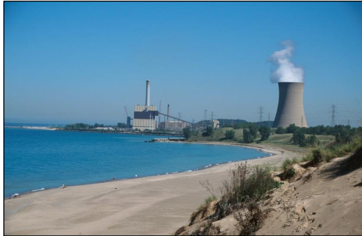
Figure 3. Coal-Fired Thermoelectric Power Plant Cooling Tower, Lake Michigan.

U.S. Geological Survey 13 and the GLRWUD for 2005. However, the magnitude of the discrepancies is not unusual, given typical levels of confidence in water use data. Protocols for reporting water withdrawals to the GLRWUD 14 adopted by the Great Lakes Compact Council and Regional Body in 2009 should improve the accuracy of water use data.